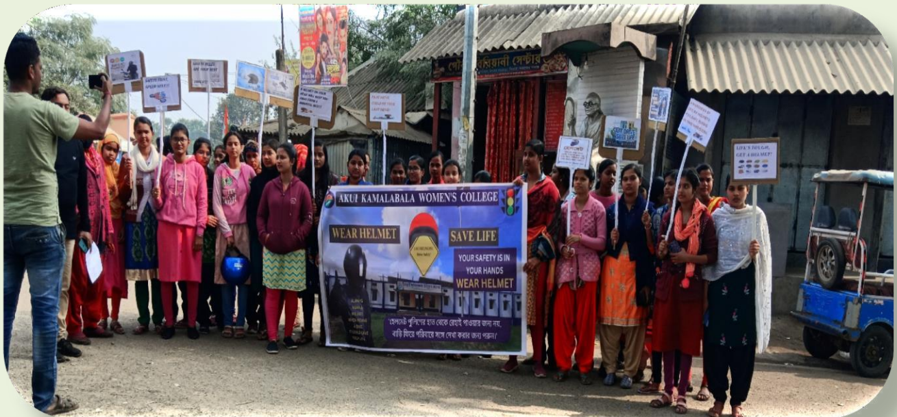
'SAFE DRIVE, SAFE LIFE' AWARENESS PROGRAMME