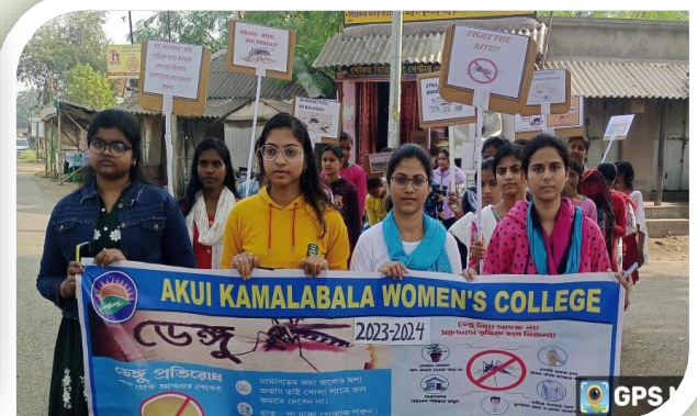
DENGUE AWARENESS PROGRAMME