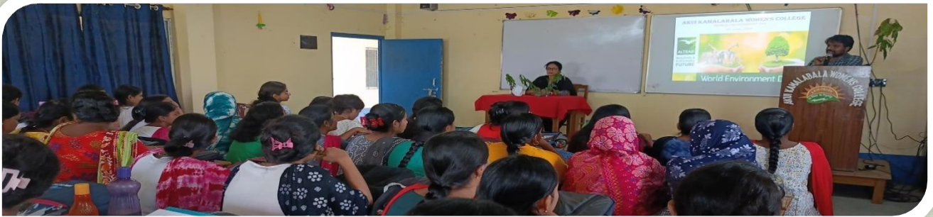
WORLD ENVIRONMENT DAY CELEBRATION