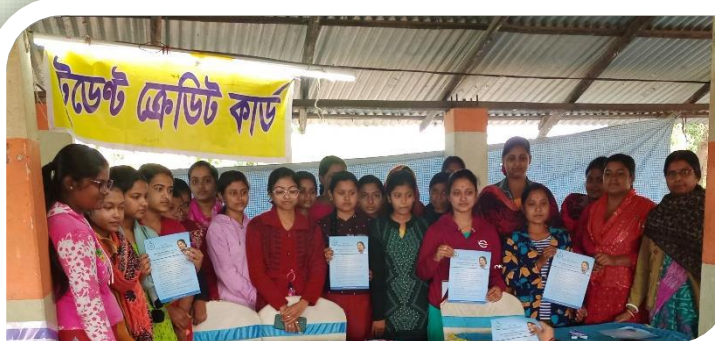
STUDENT CREDIT CARD AWARENESS CAMP