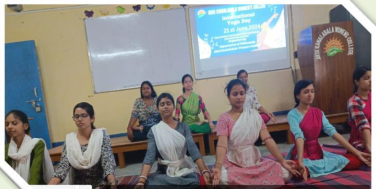
INTERNATIONAL YOGA DAY CELEBRATION