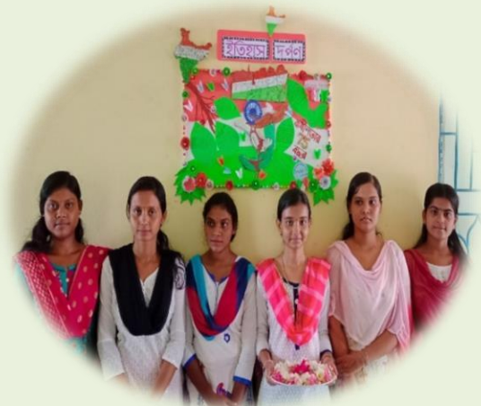
WALL MAGAZINE PUBLICATION CEREMONY