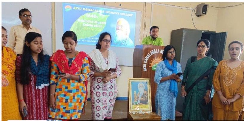
CELEBRATION OF RABINDRA JAYANTI